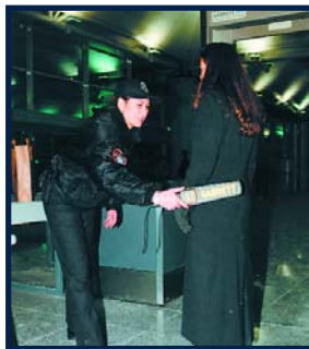
U.S. & International Airports